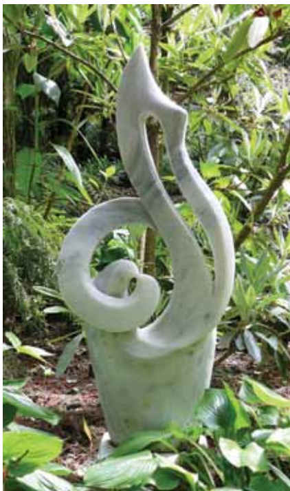
Eden Gardens marble sculpture - Life is Hope