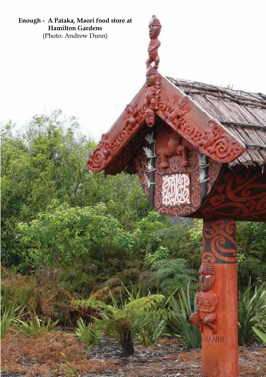
Enough - A Pataka, Maori food store at Hamilton Gardens