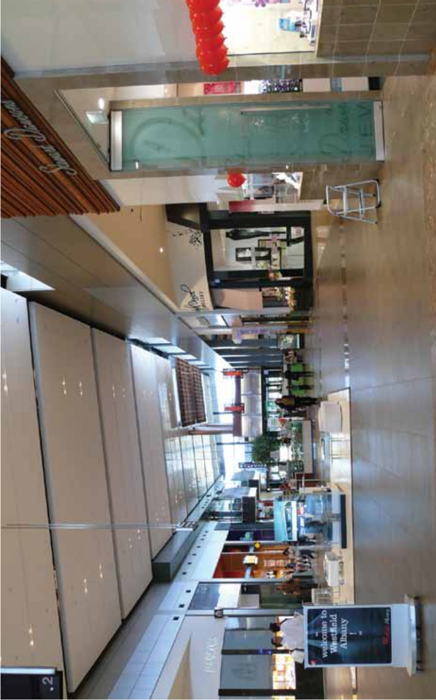
Entrance Foyer to Albany's Secular Cathedral